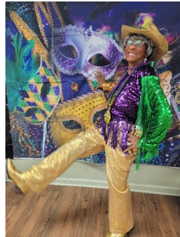
Black History Month Celebration!