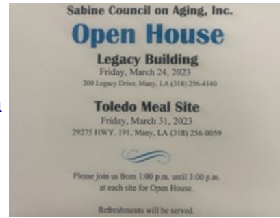
First day in the new building of the Many site!

Has a new addition to the Legacy Building and the Toledo Site has been renovated with a new addition as well. Open house for the main office in Many, the Legacy Building will be held on March 24, 2023 and the Toledo Meal Site will be held on March 31, 2023.